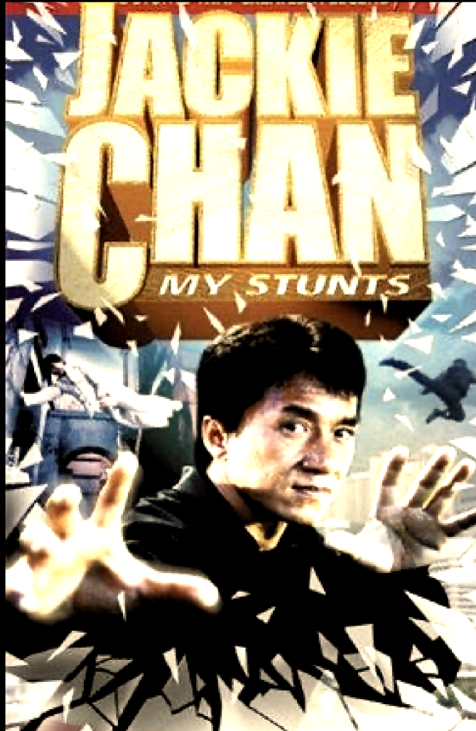
Jackie Chan: My Stunts 1998

Features a behind-the-scenes look at stunt performers and fight choreography.