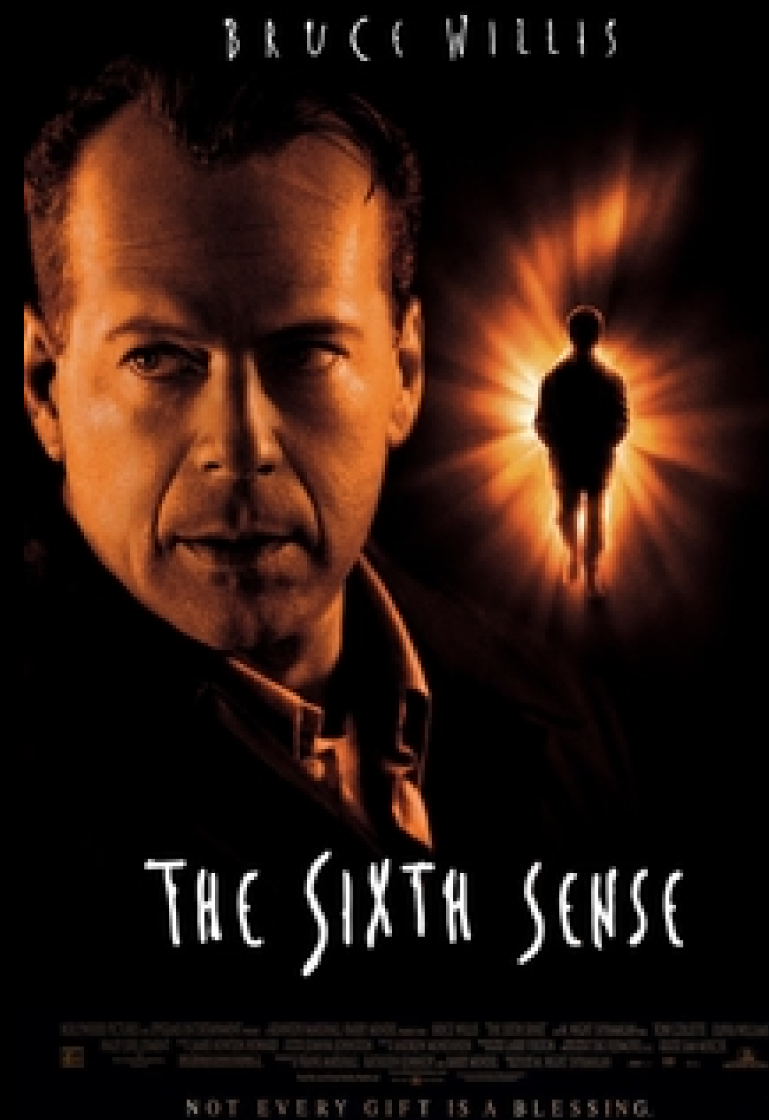
The Sixth Sense 1999

Similar premise of the main character being a young person who can communicate with the dead.